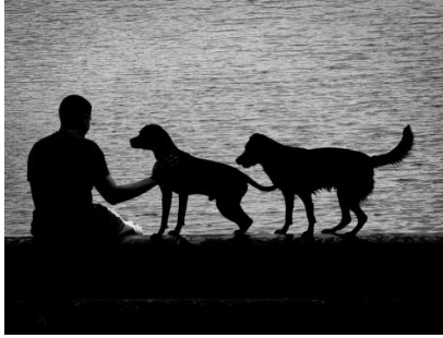
1 st Zelma Lias