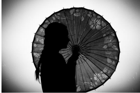
2 nd Bill Tindall