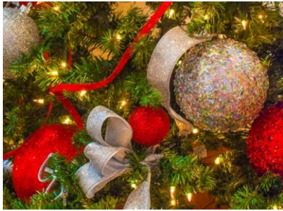
1 st Zelma Lias